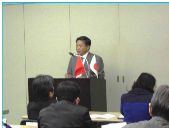
Presentation by the Director of the Department of Natural Resources and Environment of Ba Ria-Vung Tau Province

The people from Ba Ria-Vung Tau Province exhibited their booth at the Kawasaki International Eco-Tech Fair while they were visiting the booth of KaWaBiz NET, which strengthened the friendship with Kawasaki City.