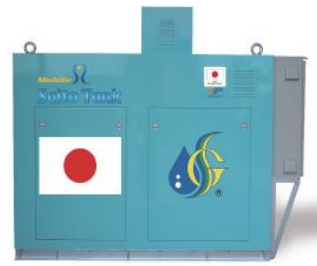
MST LAOS Ver.

Challenge though "water" to the people in the world