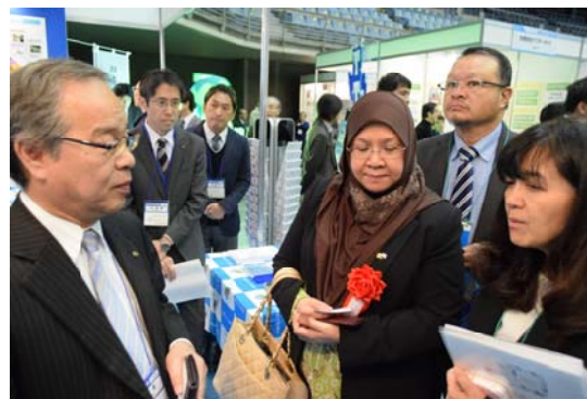
Booth visit by foreigners