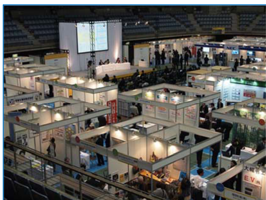
Exhibition Hall (2013)

Kawasaki International Eco-Tech Fair 2014 http://www.kawasaki-eco-tech.jp/english/index.html