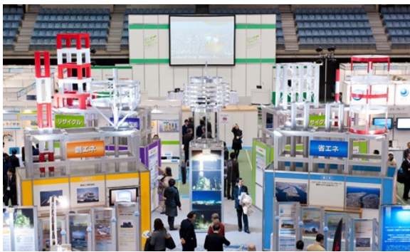
Exhibition Hall (2012)

Kawasaki International Eco-Tech Fair 2013 http://www.kawasaki-eco-tech.jp/